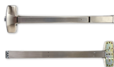
Exit Bar Control