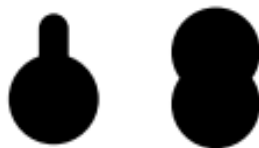
Conventional, Restricted, High Security, SFIC