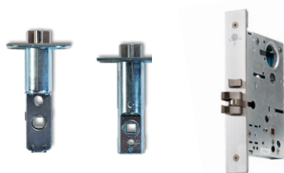
Tubular 2.375 in. (60mm) and 2.75 in. (70mm) latch